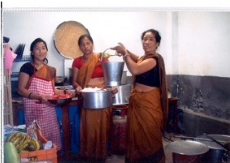
Table was not good for the huge pots.

previously, it was a problem to cook on the floor of the kitchen.