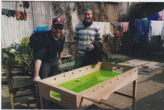
Table football is very new to our kids.