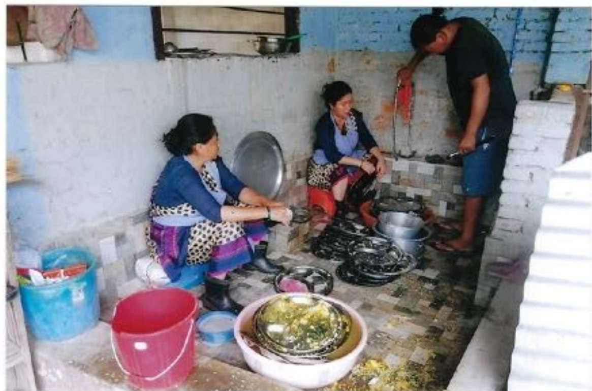
Washing the plates of 170 children is not a easy job.