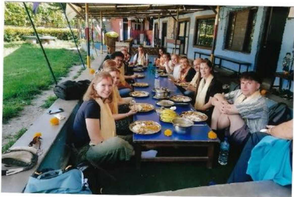
Wel-come Lunch for the visitors.