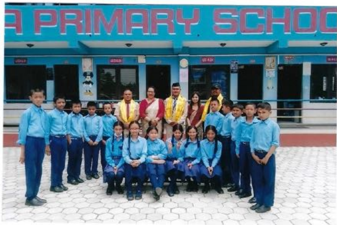
"Nepal Scouts" Class 5, with the Scoutmaster.