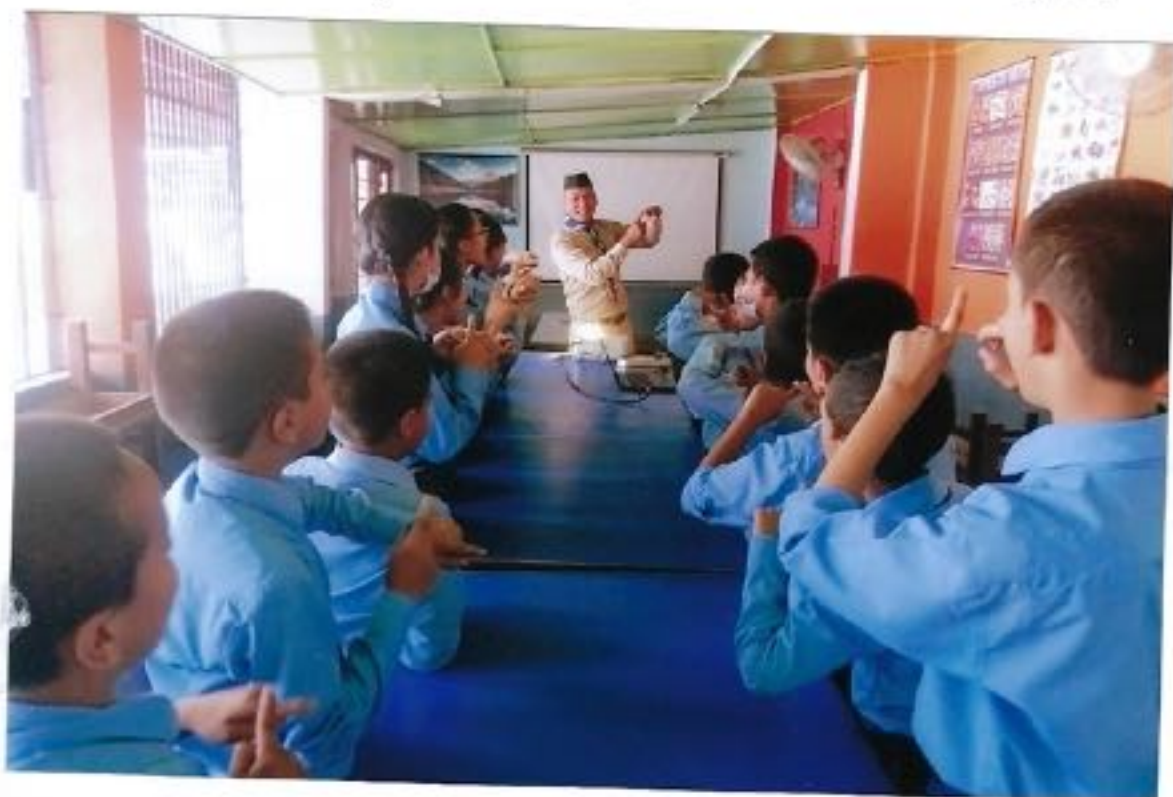
We started Scout training in Asha School too, for the Class 5 students.