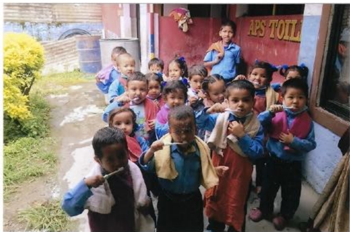
Mouth wash - Teeth Brush after meal.