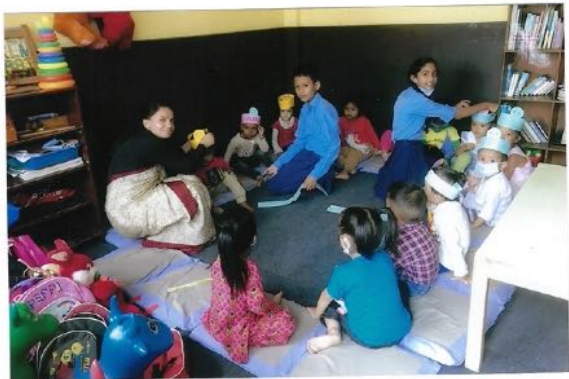
The nursery kids.